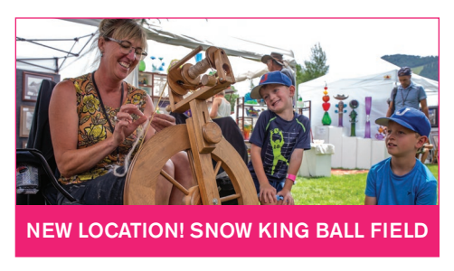
ART FAIR JACKSON HOLE JULY 10-12 | AUGUST 7-9 FRI & SAT 9AM-5PM, SUN 9AM-3PM