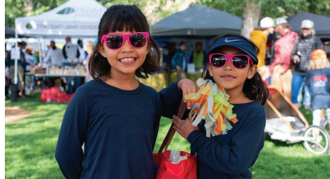
OLD BILL'S FUN RUN SEPTEMBER 12