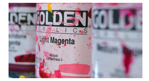
GOLDEN ACRYLICS LECTURE & DEMONSTRATION AUGUST 20 | 6-8PM | FREE