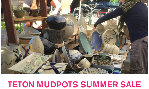
JUNE 25-26 | 10AM-6PM