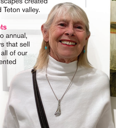
Annual Members Show