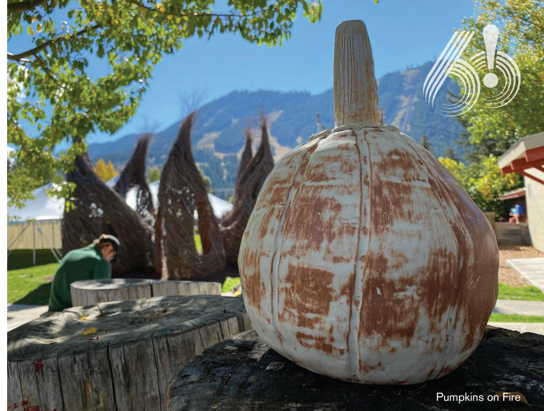
Pumpkins on Fire